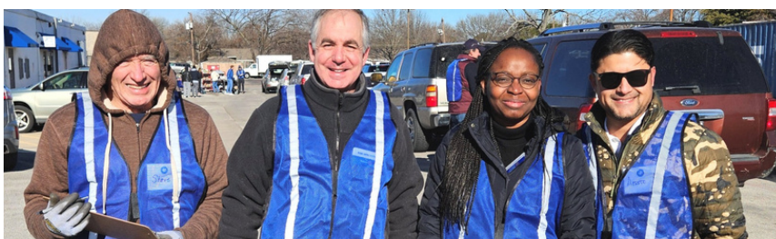
SATURDAYS ARE ONLY POSSIBLE WITH VOLUNTEERS