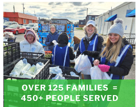
OVER 125 FAMILIES = 450+ PEOPLE SERVED