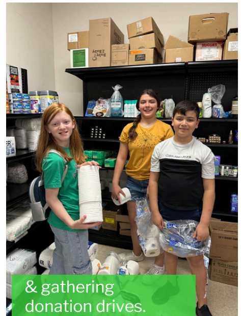
& gathering donation drives.