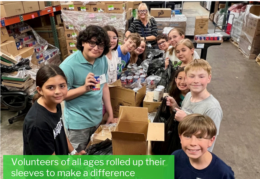
Volunteers of all ages rolled up their sleeves to make a difference