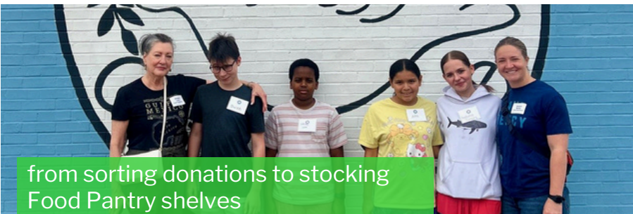
from sorting donations to stocking Food Pantry shelves